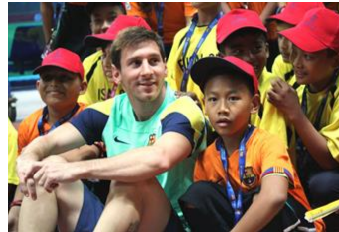
With Lionel Messi