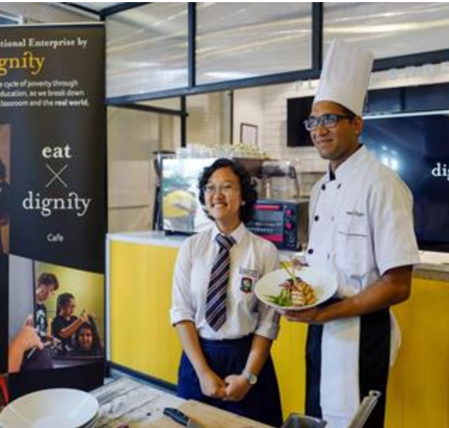
eat X dignity