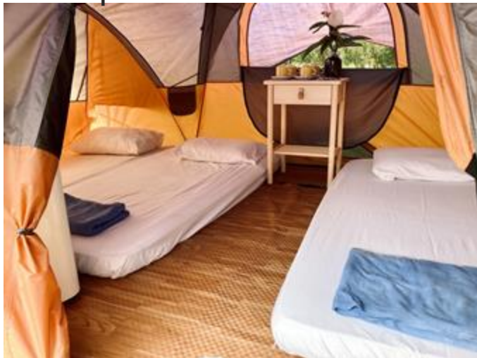
Accommodation for visitors