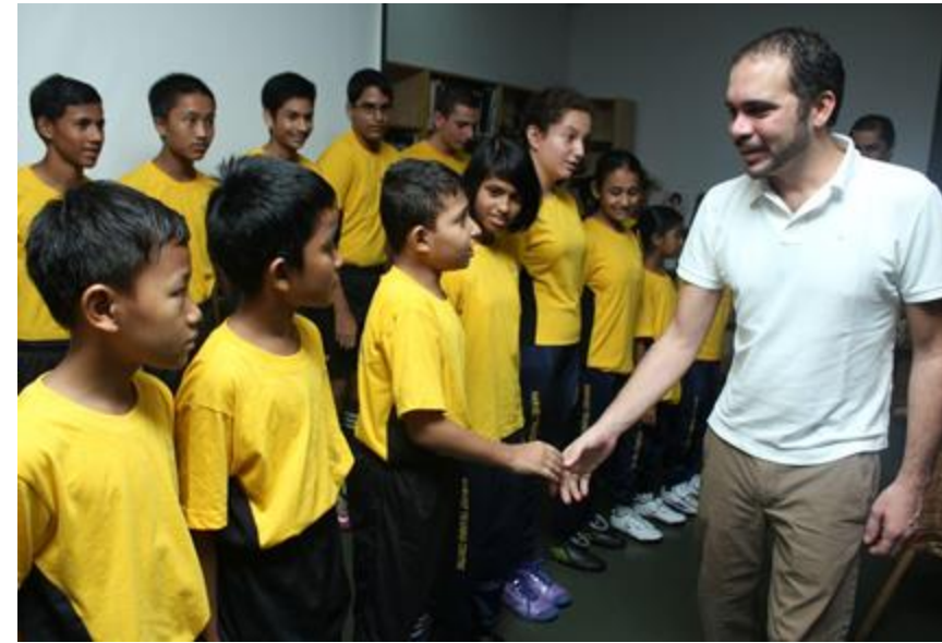
Hosted Prince Ali bin Hussein of Jordan in 2012