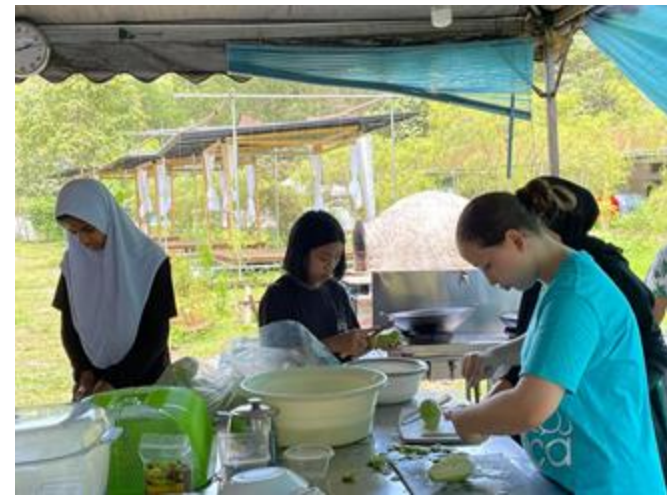
Set up a staff/ outdoor kitchen