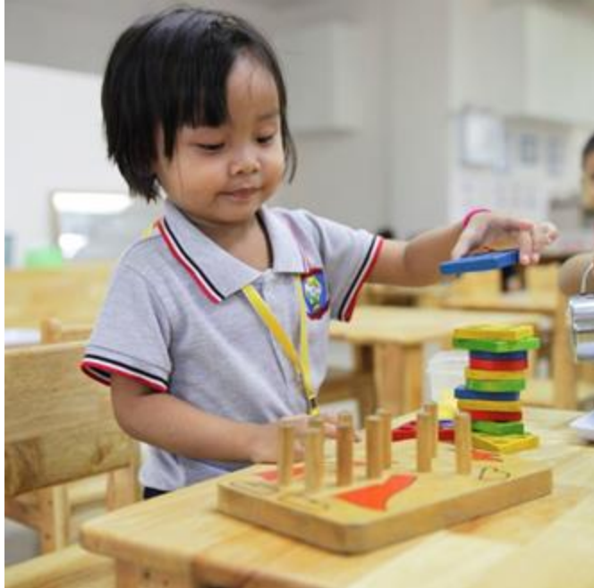
Toddler Stimulation Programme 18 months – 3 years