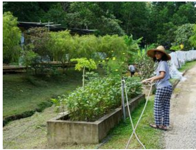
Raised bed for vegetation