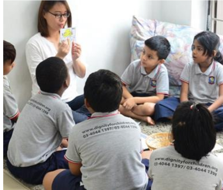
Preschool Programme 4-6 years