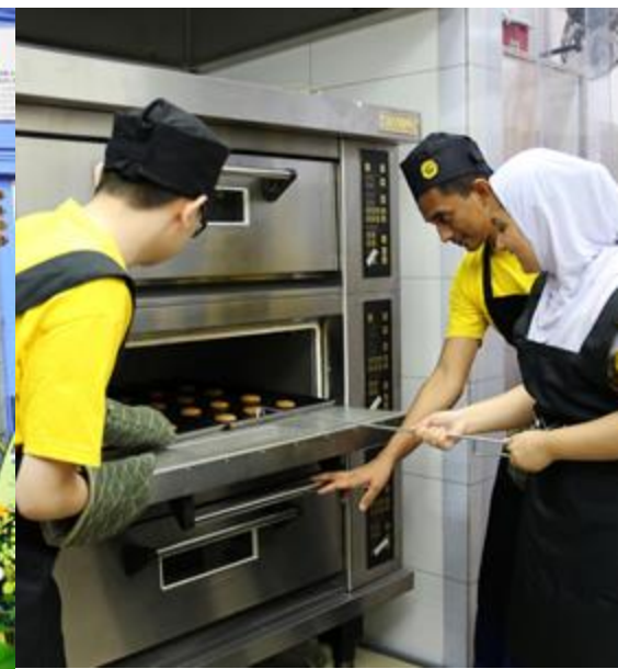
bake X dignity