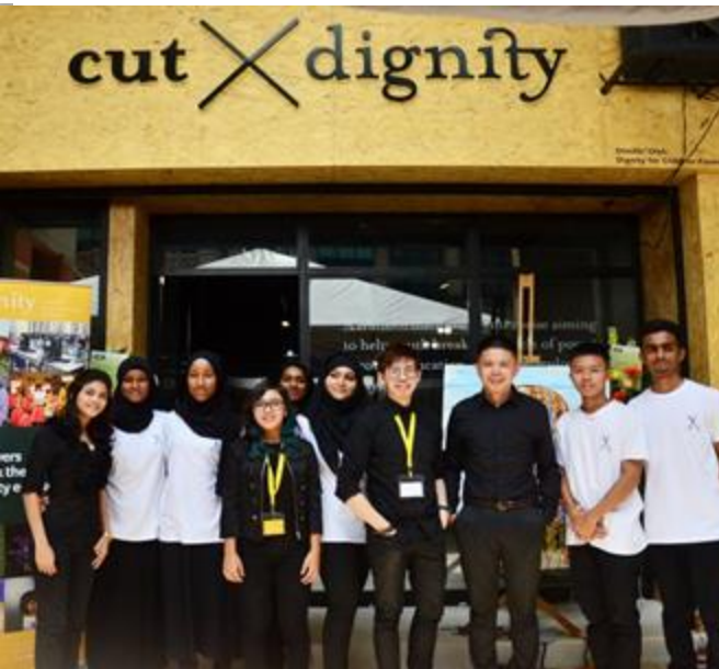
cut X dignity