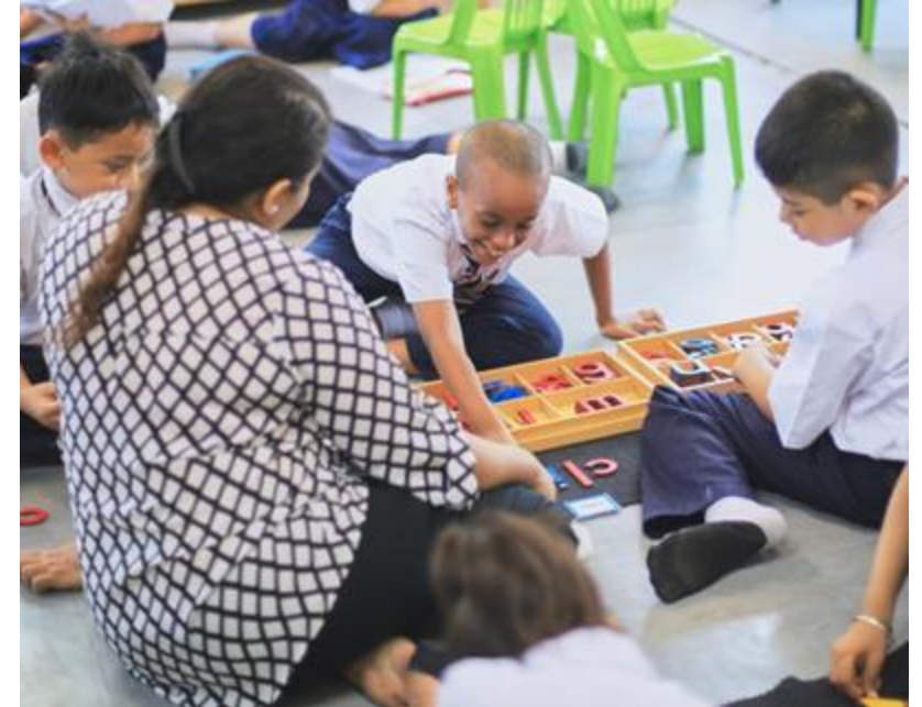
Primary Programme 7-14 years • Lower Primary • Middle Primary • Upper Primary

Dignity's education programs are uniquely child-centred and employ the Montessori philosophy, whereby children learn through the exploration of the environment and via carefully curated learning materials in mixed-age groups.