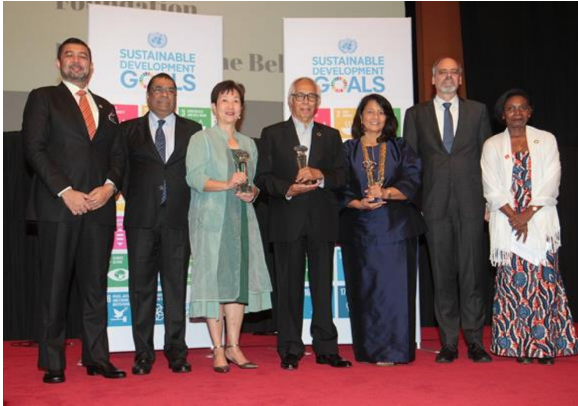
United Nations Malaysia Award 2019 for contributions to the 2030 Agenda for Sustainable Development for the Leaving No One Behind category