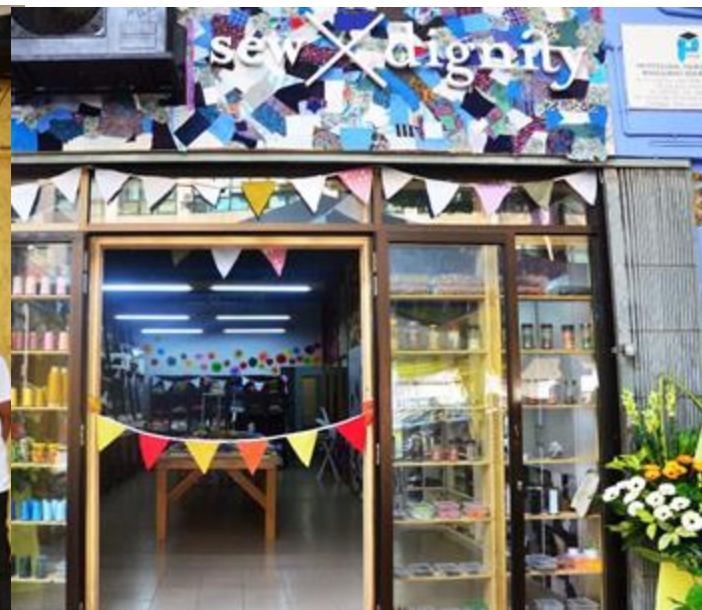
sew X dignity